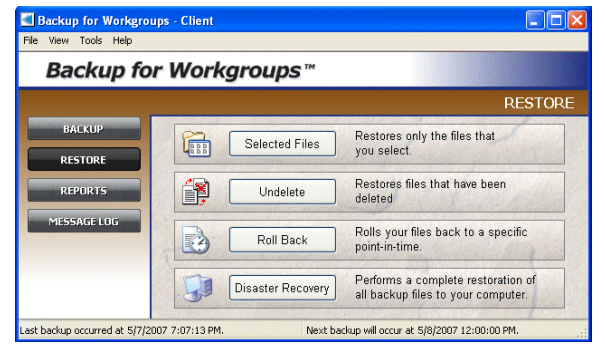
Fast & easy data recovery is just a click away!

Backup is a breeze with Backup for Workgroups.